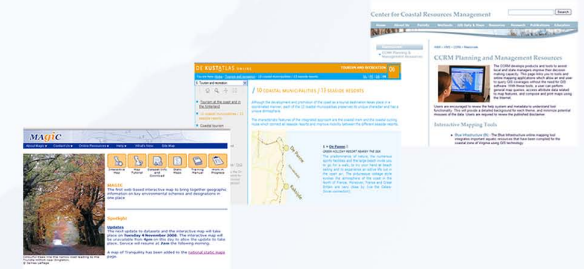
CWAs provide valuable information, data and tools for coastal zone managers and decision makers.

- Involve representatives of the user communities to help in tailoring CWAs to their needs.