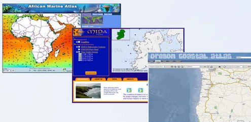
CWAs can be local, regional, national and international in scale.

We define a coastal web atlas (CWA) as: a collection of digital maps and datasets with supplementary tables, illustrations and information that systematically illustrate the coast for the purposes of coastal zone management and planning, oftentimes with cartographic and decision support tools, all of which are accessible via the Internet.